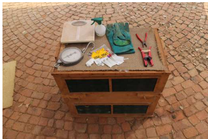
Figure 1: A vulture crate used as a processing table. The work space has been covered in a soft carpet and displays the necessary tagging tools and personal protection gear.

Suitable eye and face protection, gloves, a long-sleeved shirt, trousers and closed shoes are necessary when working with vultures. One of the best tables for processing vultures is a vulture crate covered with carpet for the bird's comfort (Fig. 1). Alternatively, a sturdy folding table measuring 1.5 x 0.7m will suffice. This allows easy access from all sides for the team to work on the bird. Catching and handling vultures may result in serious and sometimes permanent injuries. Pay particular care when holding the bird or replacing it on the ground to keep your face away from the beak.