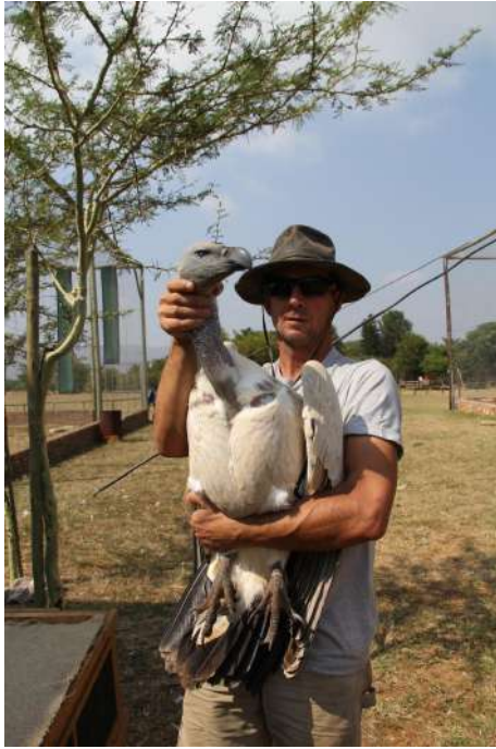
Figure 3: The proper way to hold a large vulture. The head is secured in one hand while the body, wings, and feet are restrained by 'hugging' the vulture.