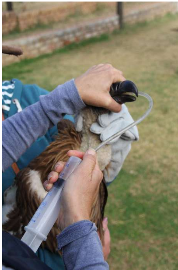
Figure 7: Given fluids orally, securing the head and beak and safely inserting the tube down the bird's beak and into the crop

the tube feels obstructed, take great care to assess that the tube is being sent down the correct pathway. In Gyps vultures, you will be able to see the tube moving down the neck. In other bird species where the neck is feather-covered, the tube can easily be felt as it is passed down. If you cannot see the tube moving down the neck, remove the tube and try again. The tube should be inserted all the way down the neck into the crop. Again, DO NOT give fluids until you can visually or physically confirm that the tube is placed correctly and is all the way down into the crop. A large Gyps vulture or Lappet-faced vulture should receive up to 180ml of water, Ringer's lactate solution or other rehydrating solution at one time. You will see the crop expand with the fluids. If the bird is severely dehydrated, the crop will subside quickly and more fluids can be given. Do not give oral fluids to any bird who is not strong enough to hold their head up, otherwise they can regurgitate the fluid and inhale it, resulting in an aspiration, pneumonia, and almost certain death (Fig. 7).