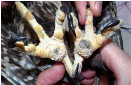
Figure 8: Image showing typical bumble-foot in a bird of prey's feet

The bird should be placed on a course of appropriate antibiotics (e.g. Nuflor) and the foot needs to be bandaged as per the instructions below. Preferably, take a microbiology swab for culture prior to administering any antibiotic. This information allows for a more directed antibiotic therapy and reduces the risk of resistance or treatment failure.