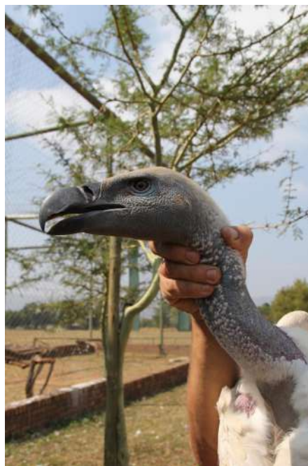
Figure 2: The proper hand placement to stabilize a vulture head

Once the selected vulture is within close reach, its neck should be grabbed from behind first, just below the jaw bone (Fig. 2). Do not grab the head from the front as you can crush the trachea, potentially causing permanent and irreversible harm. Do not grab lower than the jaw bone as the bird can turn its head around and bite you. Do not grab higher as you will lose your grip and may cause injury to the head, especially the ears or eyes of the bird. Use your thumb and forefinger around the back of the neck from behind the bird's head. Reach your fingers around to be against but below the jaw bone with the pressure on the sides of the neck to avoid suffocating the bird by constricting the trachea. You can be firm but not rough or too tight so as to avoid harming the bird. Great care should be taken with the hand holding the head. The head should always be held far enough away from your face and other body parts, as well as other people in your proximity. Vultures are extremely strong and can lunge and bite suddenly in defence, even when appearing calm. This can result in serious injury.