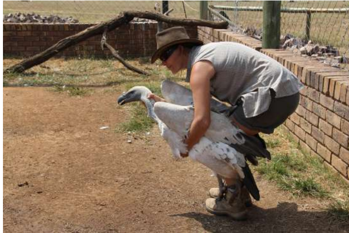
Figure 5: Preparing to release the vulture. The handler is going onto her haunches to bring the vulture to ground level.

When releasing a vulture, lower your body (Fig. 5), bringing the bird's feet to ground level, slowly allowing the bird to stand. Then release your grip on his entire body and neck at the same time, stepping away to give the bird some space (Fig. 6). Be careful never to drop or throw the bird down, nor allow the bird to fall prior to lowering it gently to ground level. When releasing the bird or placing it back inside the enclosure, remain still and allow the bird to walk or fly away from you, rather than panicking it, in which case it may take off, flying into stationary objects / fences. Do not force the bird to move. Allow the bird time to recover but monitor it for any unusual behaviour that could be a sign of heat exhaustion or injury from handling. The bird will decide for itself what to do next; it might fly off, run or drink water. Never force the bird to move or fly after the handling. Simply monitor and interfere only as a last resort if the bird appears not to be fit for release.