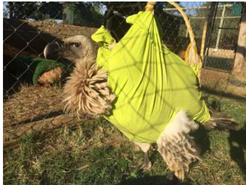
Figure 10: Cape Vulture in a sling

If there is no response or improvement within 2 weeks, the case is hopeless and the bird should be euthanised.