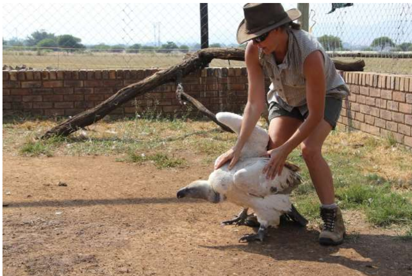
Figure 6: Releasing a vulture. Release the head and body simultaneously and step back slowly, allowing the vulture to decide where to move next.

Vultures, when given the opportunity will time their take-off to coincide with a thermal or an increase in wind strength, making the take-off easier. Birds in general prefer to take-off against the wind, and this should be considered when choosing the release site and direction. Releasing a bird from a crate should be done at ground level, and not from an elevated site such as the back of a vehicle. Pulling a bird out by a wing or the tail is unacceptable, as is tilting a crate to encourage a bird to exit. Give the bird time to leave the crate of its own accord.