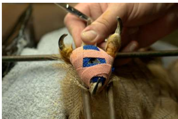
Figure 9: Doughnut-shaped bandage, note the hole in the middle of the bandage

A dry and cracked foot (but not swollen or apparently infected) such as that shown above is best treated with Preparation H (ointment rather than the gel version), by daily application for 2 weeks. Preparation H is a human treatment for haemorrhoids and is safe for use, whilst some other haemorrhoid treatments containing local anaesthetic (any drug with an 'aine' in the name) are toxic to birds.